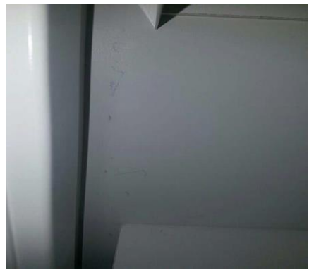
Scrub marks inside linen cupboard plaster damage. Needs further sanding and painting.