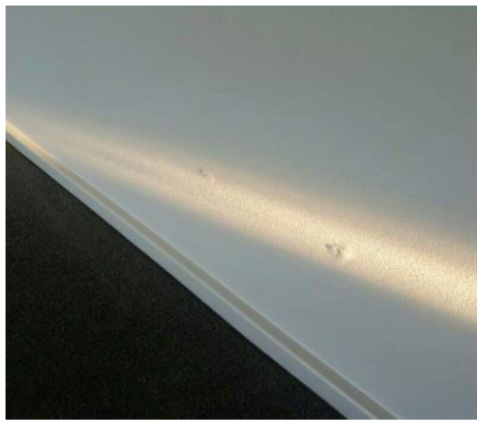
Front lounge room plaster damage. Needs further sanding and painting.