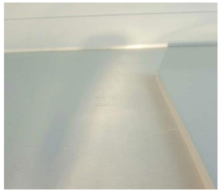
Main bedroom window plaster damage. Needs further sanding and painting.