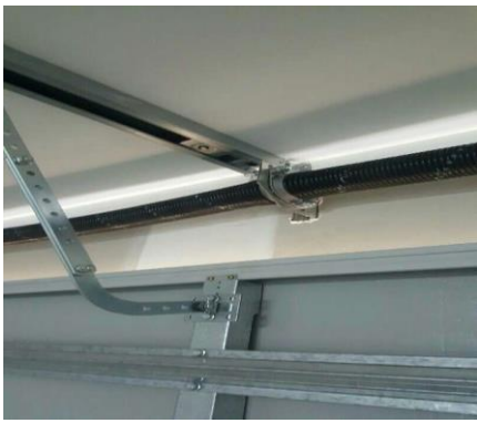
Garage door heads require painting.