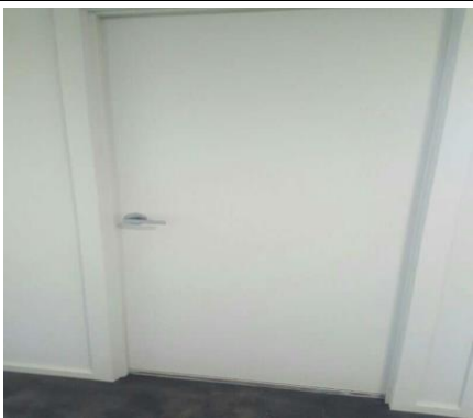
Laundry door binds at the bottom.

The following evidence of Major Defects was found: