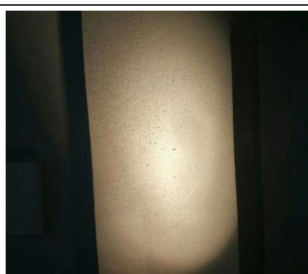
Front entry plaster square setting opening is full of air bubbles and requires filling and painting.

The following evidence of Major Defects was found: