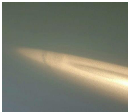
Kitchen dining room plaster damage. Needs further sanding and painting.