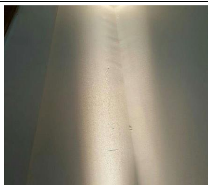
Front entry plaster internal square setting is rough and requires resetting and painting both sides of the front door.