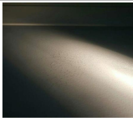
Small hall way plaster / PAINT damage. Needs further sanding and painting.