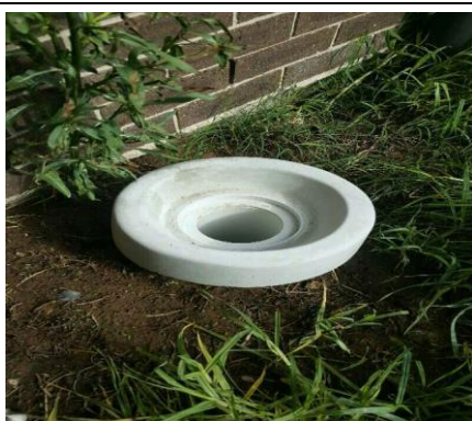
Gully needs cover fitted.

Comment: There are quite a few Minor Defects. Monitoring and normal maintenance must be carried out (see also Section F 'Important note').