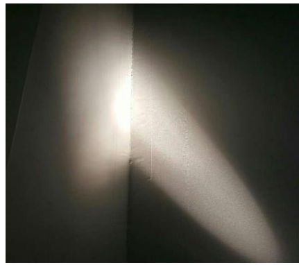
Internal corner of linen cupboard requires re square setting internal corner and repainting