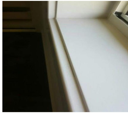
Gap filling of bedroom 3 window architraves required.