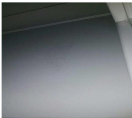
Bedroom 2 inside cupboard plaster damage. Needs further sanding and painting.