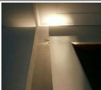
Front entry plaster internal square setting is rough and requires resetting and painting.