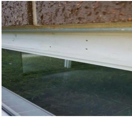
Unpainted timber reveals on rear window on the dining room.